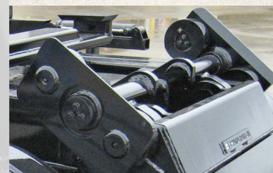
Dual Rear Rollers