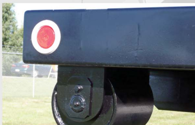
Rollers & Brackets