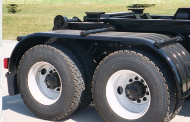
Tandem Axle - Steel Fender