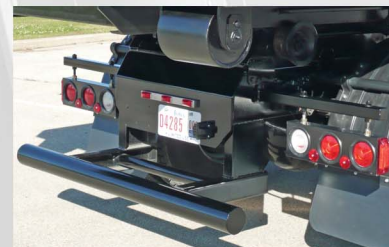
Rear Light Bar & Bumper