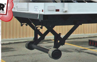
Drop Down Bumper