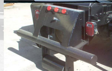
Stabilizer w/Rear Bumper