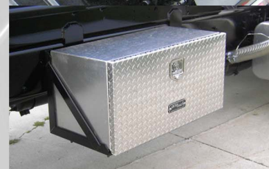
Aluminum Tool Box