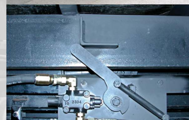
Container Variable System (CVS)